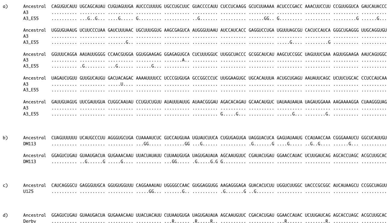
Figure 1 Sequences of the gene encoding the PP3 protein of sigma virus that contain clusters of A to G mutations. The sequences are shown in positive sense (the mRNA sequence rather than the genome sequence). (a) Isolates A3 and A3 E55 (2'916 - 2'316). These were laboratory maintained lines that were split from each other ~15 years ago. (b) The field isolate DM113 (3'194 - 2'954). (c) The field isolate U125 (2'693 - 2'574). (d) The field isolate Derby (3'074 - 2'954). This isolate was polymorphic for five A to G changes in the PP3 protein (these ambiguous bases are indicated by the wobble code R). In all the panels, sites that have not been mutated are represented by a period and the ancestral sequences were reconstructed by parsimony using a phylogeny of the viral sequences. The nucleotide locations refer to the position in negative sense genome of Genbank accession AM689308 (isolate A3).

of the gene encoding the PP3 protein (Figure 1). However, this is a special case, as these five changes are polymorphic at these sites (both As and Gs are present in the RNA extracted from a single infected fly line), suggesting that only a proportion of the viral genomes have been edited. Again, we tested whether sites preferred by ADAR were more likely to have mutated, but found they were not (Table 1). Other than these two examples, there was a